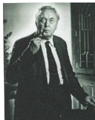
14 Harold Wilson