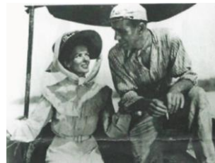
10 Catherine Hepburn & Humphrey Bogart