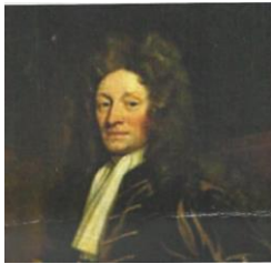
1 Sir Christopher Wren