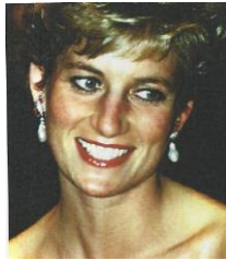
3 Princess Diana