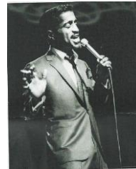
8 Sammy Davis Junior