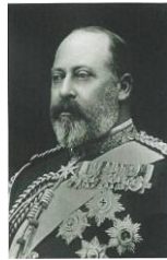
2 King Edward VII