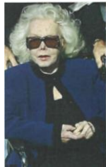
7 Zsa Zsa Gabor