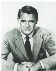
5 Cary Grant