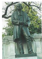
12 Isambard Kingdom Brunel