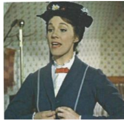
4 Julie Andrews