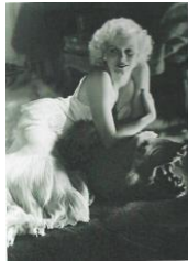
6 Jean Harlow