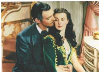
9 Clark Gable & Vivien Leigh